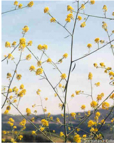
Brassica Nigra / Black Mustard