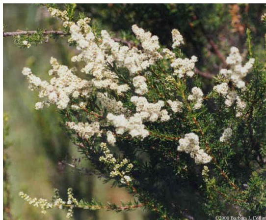
Adenostoma Fasciculatum / Chamise