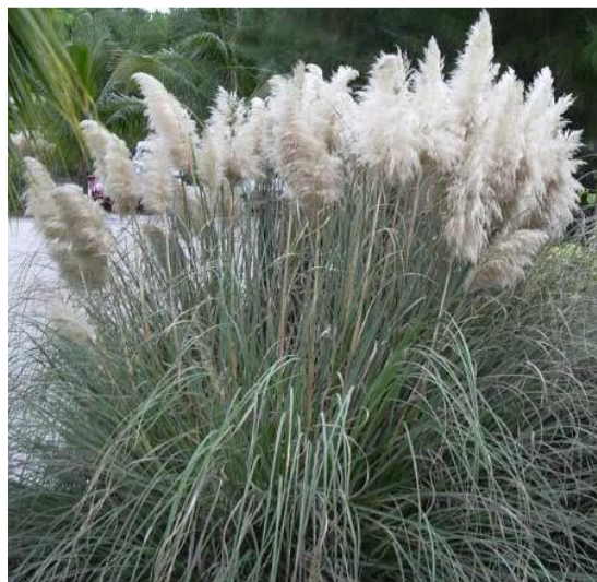
Cortaderia Selloana / Pampas Grass