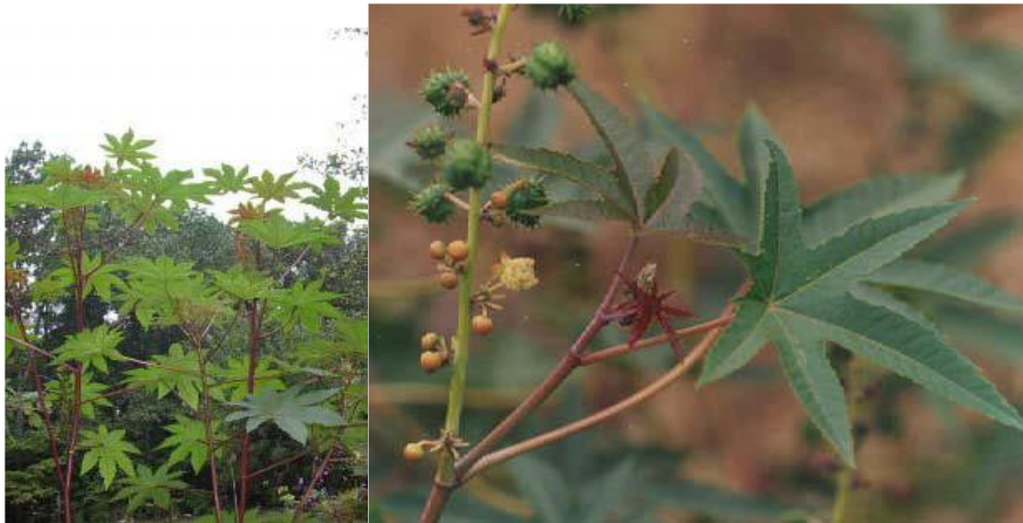
Ricinus Communis / Castor Bean Plant