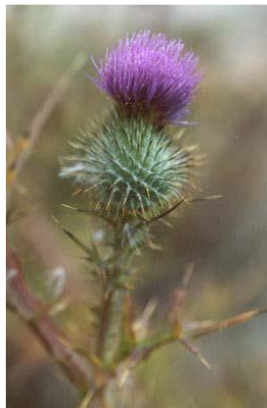
Cirsium Vigare / Wild Artichoke