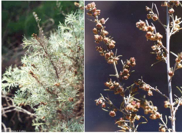
Artemisia Californica / California Sagebrush