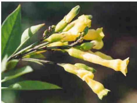
Nicotiana Glauca / Tree Tobacco