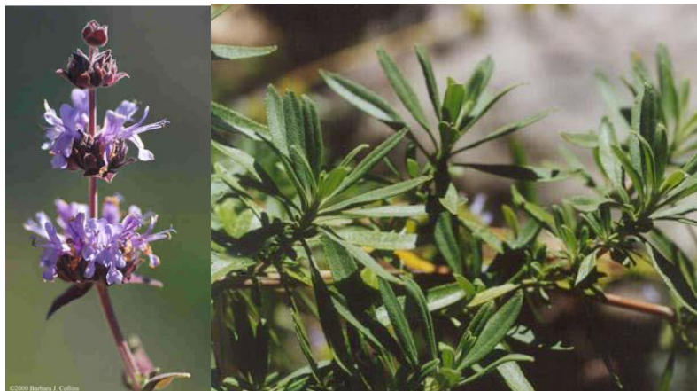
Salvia Mellifera / Black Sage