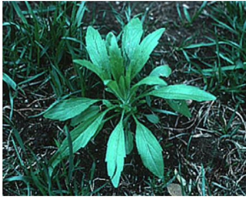
Conyza Canadensis / Horseweed