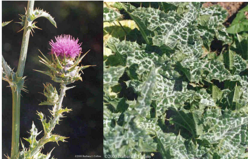
Silybrum Marianum / Milk Thistle