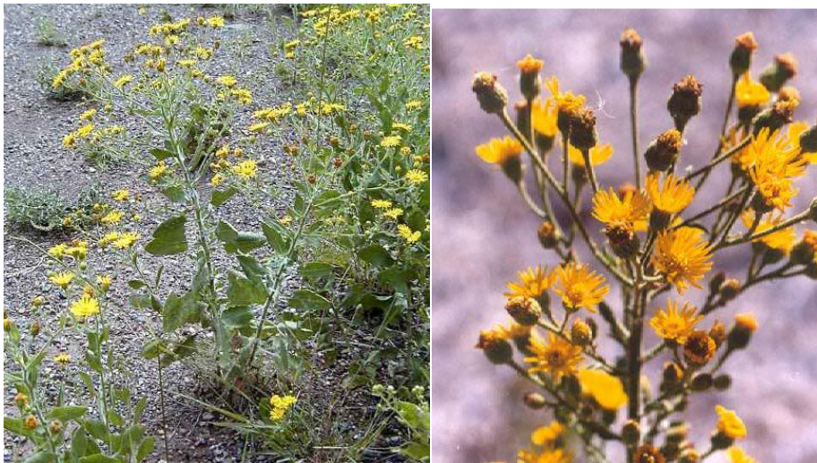
Heterothaca Grandiflora / Telegraph Plant