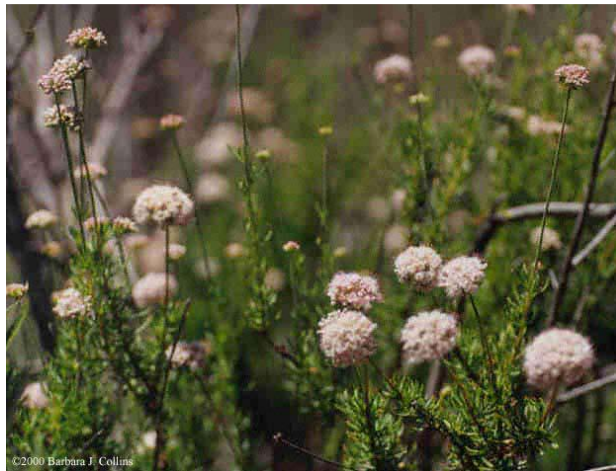
Eriogonum Fasciculatum / Common Buckwheat