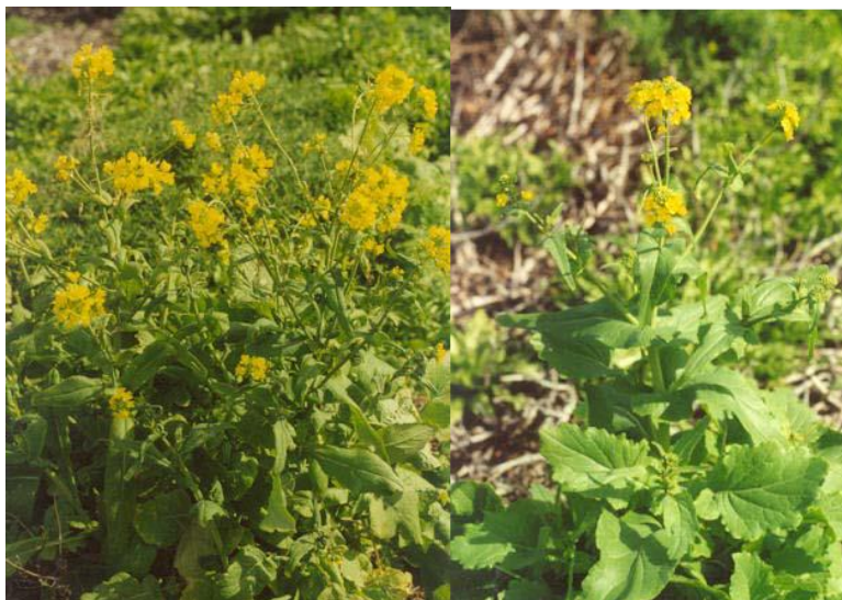
Brassica Rapa / Wild Turnip, Yellow Mustard, Field Mustard