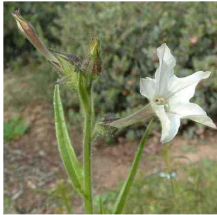
Nicotiana Bigelevii / Indian Tobacco