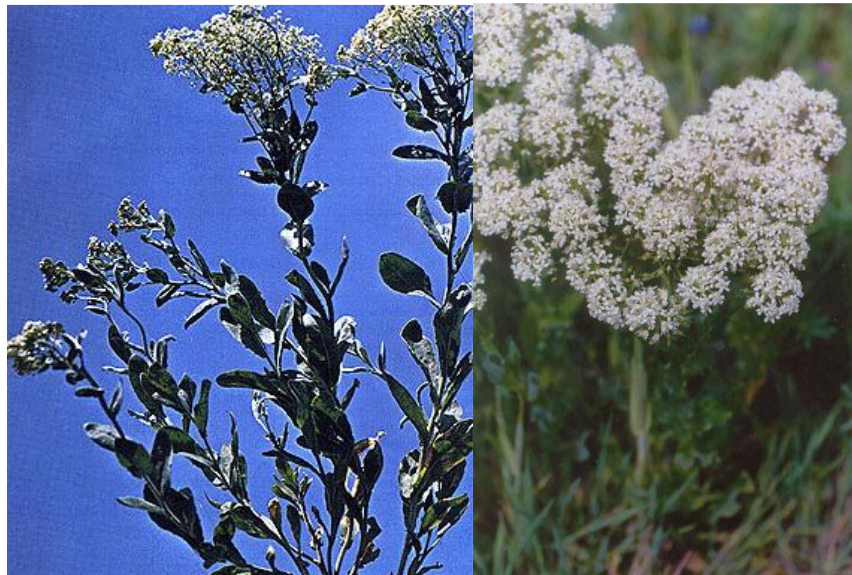
Cardaria Draba / Noary Cress, Perennial Peppergrass