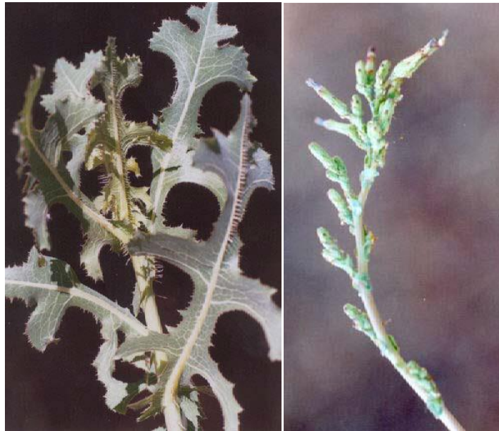
Lactuca Serriola / Prickly Lettuce