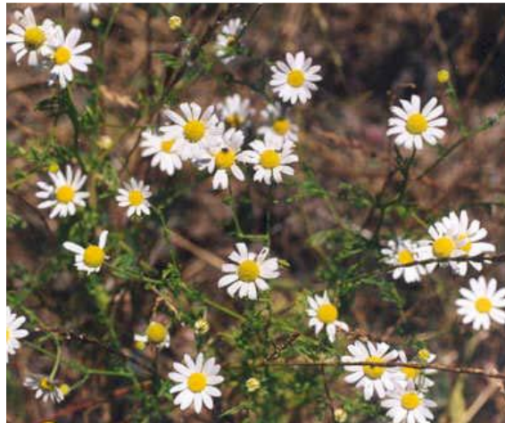
Anthemix Cotula / Mayweed