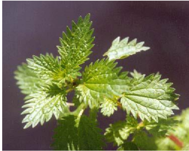
Urtica Urens / Burning Nettle