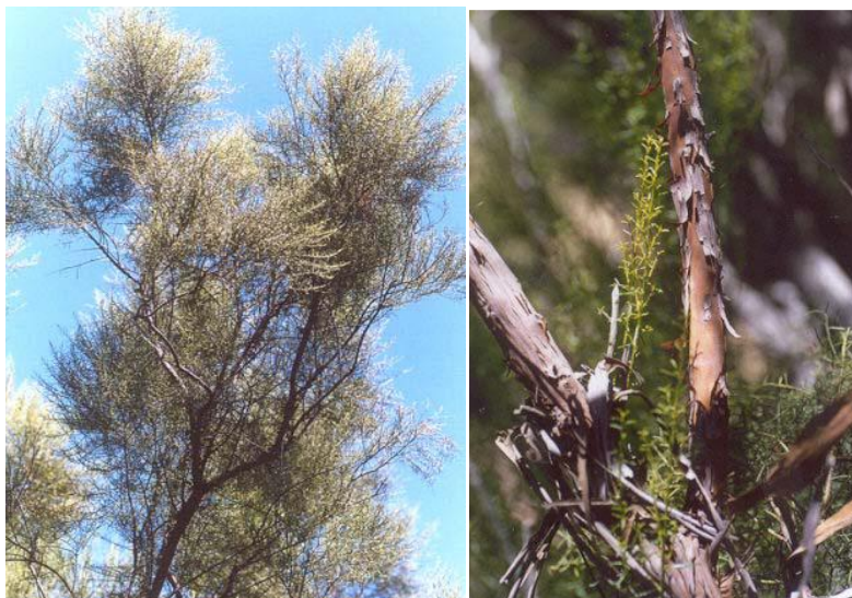
Adenostoma Sparsifolium / Red Shanks, Ribbon Bush