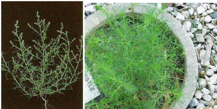
Russian Thistle / Tumbleweed