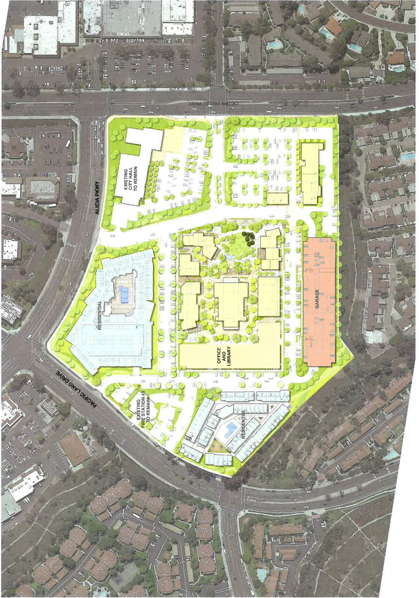
Figure 3 - Project Site Plan