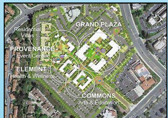
Agora Arts District - Site Rendering

www.cityoflagunaniguel.org/list.aspx?ListID=763